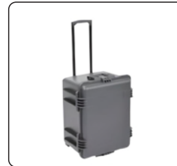
carrying case (optional)